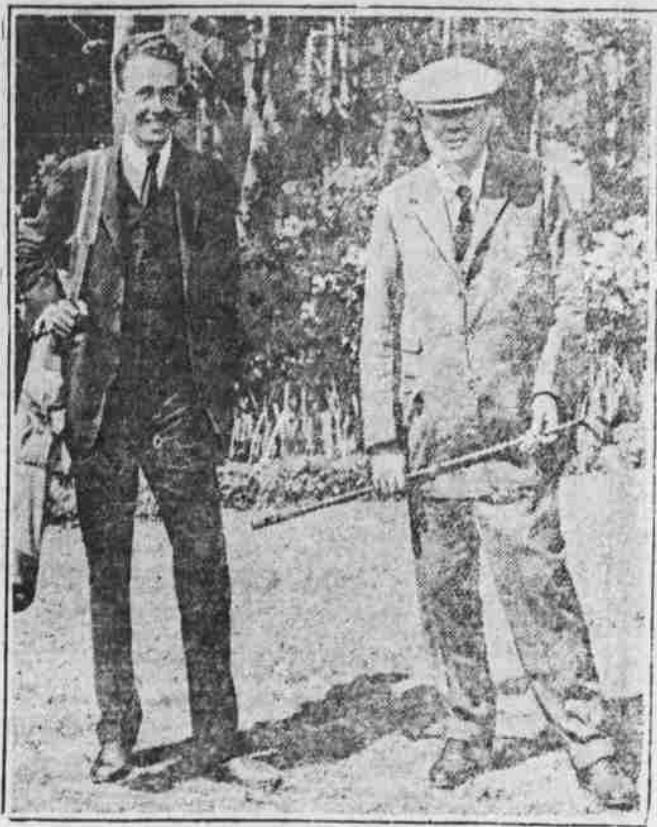
Lord Northcliffe had a millionaire caddy when he golfed at Victoria, British Columbia. You see, Cornelius Vanderbilt is a newspaper reporter and he acted as Northcliffe's caddy while he interviewed the noted English publisher.