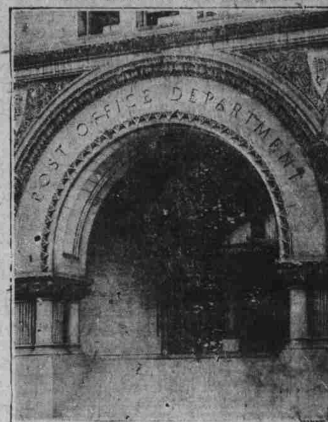
"Say, what building's that?" Every Washington visitor used to ask street car conductors and traffic cops that when they passed the Post Office Department on Pennsylvania Avenue. Now Will Hays, postmaster general, has put a sign over the door to identify the place.