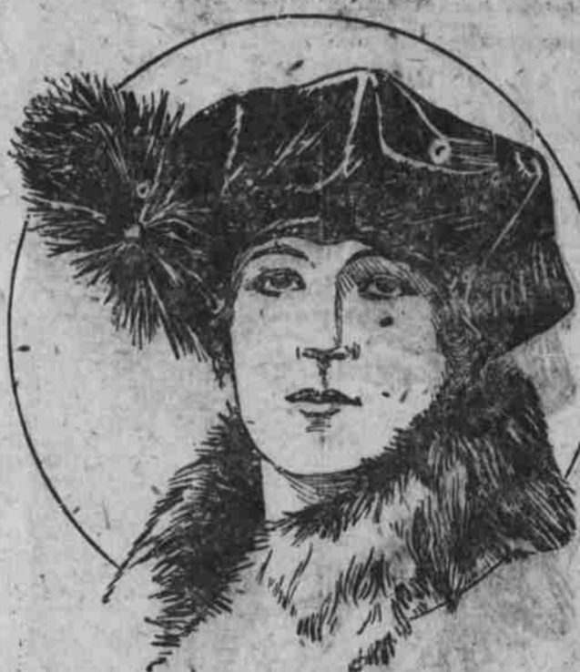
Here's the very latest Tam. No, it isn't straight from Scotland—it's from Paris. Franklin Simon has imported this eight-covered tam with its uncured ostrich cabochon. The new tam suggests those smart little hats which Henry VIII affected when he was all dolled up to make a hit with the ladies.