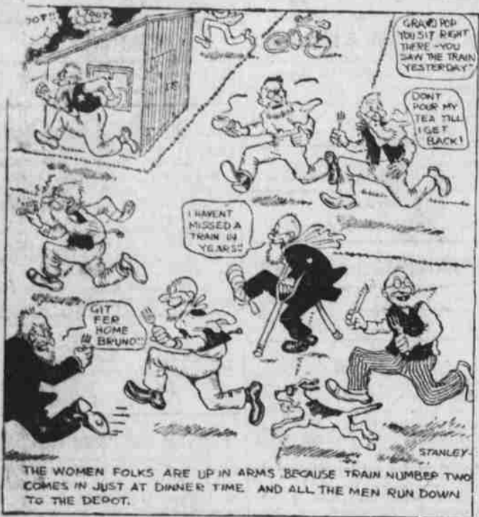
THE WOMEN FOLKS ARE UP IN ARMS BECAUSE TRAIN NUMBER TWO COMES IN JUST AT DINNER TIME AND ALL THE MEN RUN DOWN TO THE DEPOT.