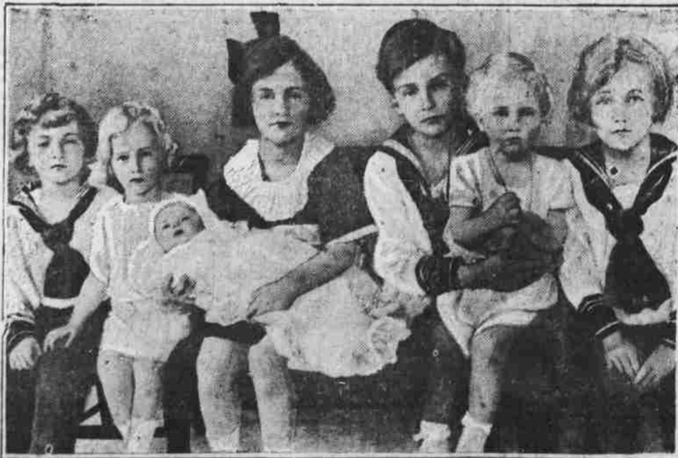
This is the latest photograph of the children of Carl, exiled emperor of Austria, and Ex-empress Zita. From left to right they are Felia, Karl Ludwig, Maria Antonia, Adolheid, Crown Prince Otto, Rudolph and Robert. This is the first picture received in America of the newest babe. Recent stories from Europe say that Charles again will attempt to resume his old throne. Other rumors are that he will leave Switzerland for Spain.