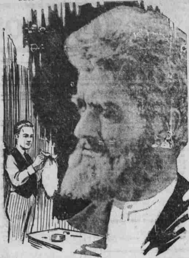
This actor is listed in the cast of "The Hell Divers" as Alexander Brown. But he is Richard Bennett, famous for years on the stage as a producer. He put on the whiskers to take part in his first play when Theodore Roberts could not take the part because of