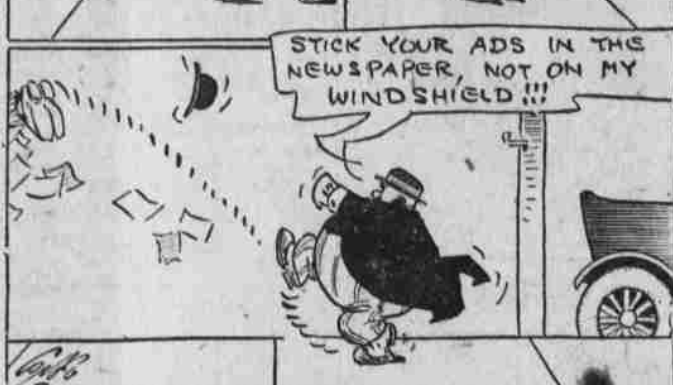
STICK YOUR ADS IN THE NEWSPAPER, NOT ON MY WINDSHIELD!!!

report much discouragement over a code system put into use by the mountain moonshiners.