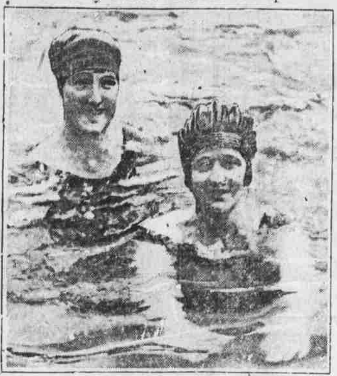
Here is Viscountess Astor, the noted British materwaman, enjoying a swim at Plymouth where she was the guest of members of the Pymouth Ladies Club. Lady Aster in the foreground.