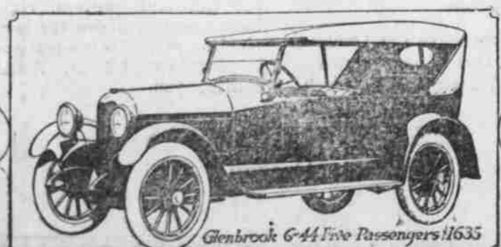
Glenbrook 6-44 Five Passengers $1635