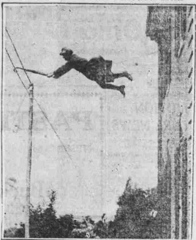
This man jumped from the roof of a house when villains, who sought his life, pursued him. He caught a telegraph wire with the crook of his umbrella and made his way to safety. This was a stunt in a detective story being filmed in Berka. And the fellow who risked his life to do it was paid in marks!

osity of the victors, have no intention of giving up their ambitious designs on Albania, which they intend to cut up and share among themselves. "Bulgaria, exhausted by the war and lustily engaged in the work of reconstruction, does not deem it prudent or advisable at the present moment to turn her Macedonian 'comitijas' loose on Serbia for a final decision. The Al-