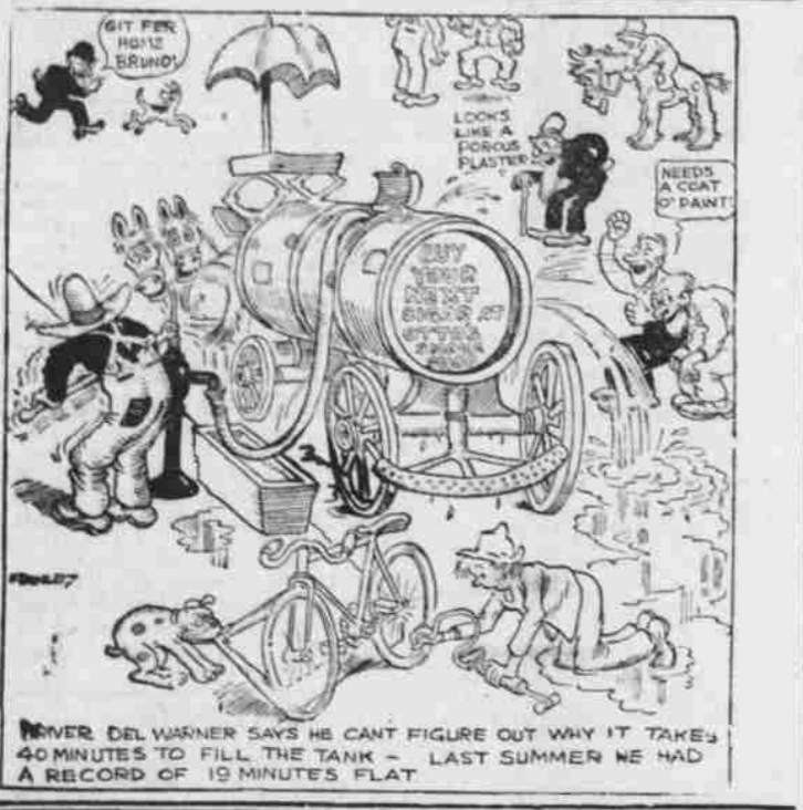
NEVER DEL WARNER SAYS HE CANT FIGURE OUT WHY IT TAKES 40 MINUTES TO FILL THE TANK - LAST SUMMER WE HAD A RECORD OF 19 MINUTES FLAT