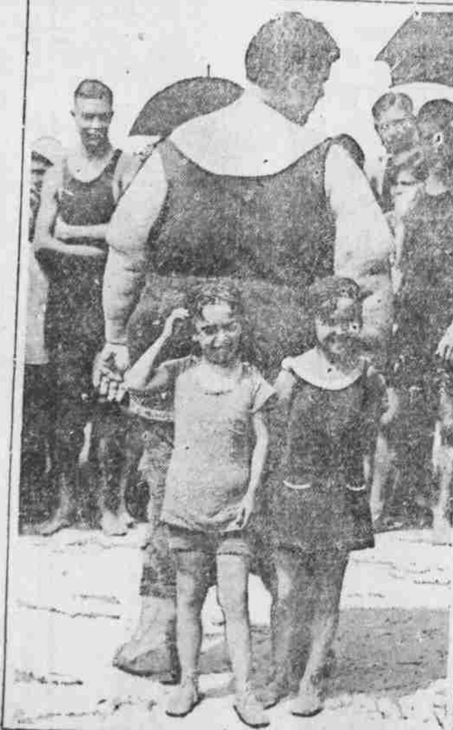
The Fat Man, the Midlets, the Bearded Lady and all the rest of the side show performers at Coney Island held a beach party to keep cool and to amuse the kiddies on the beach. Here are the Midlets hiding behind the Fat Man and the Bearded Lady can't find 'em!