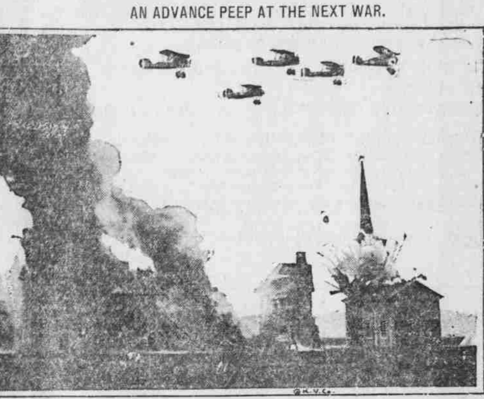
This "village" was constructed in England for a demonstration of the advances made in aerial warfare. Most of the buildings were made of spare airplane parts. The church steeple is 40 feet high. All of the pilots who took part in the bombing were veterans of the World War. When they finished—ashes!

The wheat yield of Umatilla county will average 28 bushels to the acre and there will be a five million bushels of six million bushels in the county. This is the view of H. W. Collins who by reason of his business operations has a close check on conditions. Harvesting reports show that the yield in the best land sections is heavier than usual but is not proportionately as great as in the lighter land regions. Most gratifying reports are heard of yields north and west of Pendleton but as usual the best crops are being harvested on the reservation. With approximately one third the wheat of the county sold or contracted for there is at present a lull in wheat buying. The lack of business at present is attributed more than anything else to scarcity of ocean tonnage. The larger ocean carrying companies are said to be booked up for several months in advance with the result tramp steamers alone are available for shipping at this time. A feature of the situation in this county at present is the heavy shipments being made. The Collins organization alone is said to be shipping from 25 to 30 cars of wheat a day. This wheat was bought some time ago after exporting arrangements had been made.