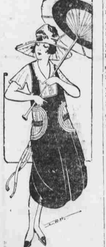
An old-fashioned jumper doesn't make an old-fashioned girl. Far from it. About 100,000 most popular and up to date of all summer gowns is this young person clad in a jumper. Thin girls, fat girls, young girls, old girls—you see every variety classified under the jumper head. Jumpers with their cool guimpes or bouffes are shown in all summer materials and all colors.