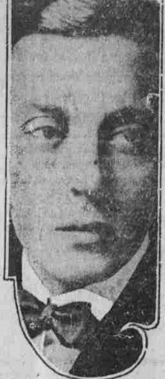
Here's a recent photo of Buster Keaton, film comedian. Even though he's happily married to Natalie Talmadge and his business is to make people laugh, no picture ever shows him smiling.