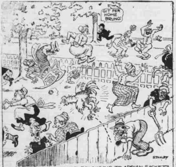
A VICIOUS RED ROOSTER BELONGING TO ADRIAN SACKETT BROKE UP THE MEETING OF THE LADIES' TRIMBLE CLUB THIS AFTERNOON