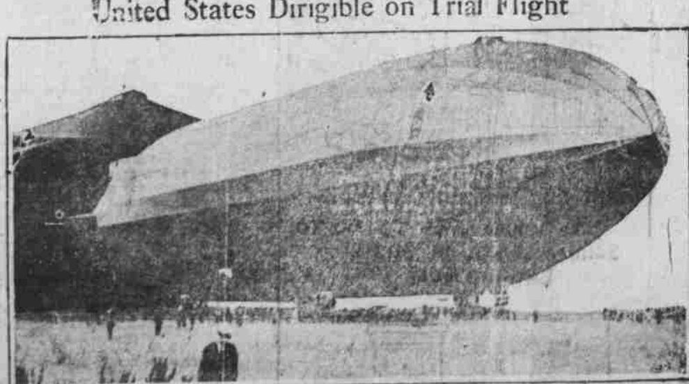
Here's the new U. S. Navy dirigible leaving her barge at Bedford, England, for her maiden flight.