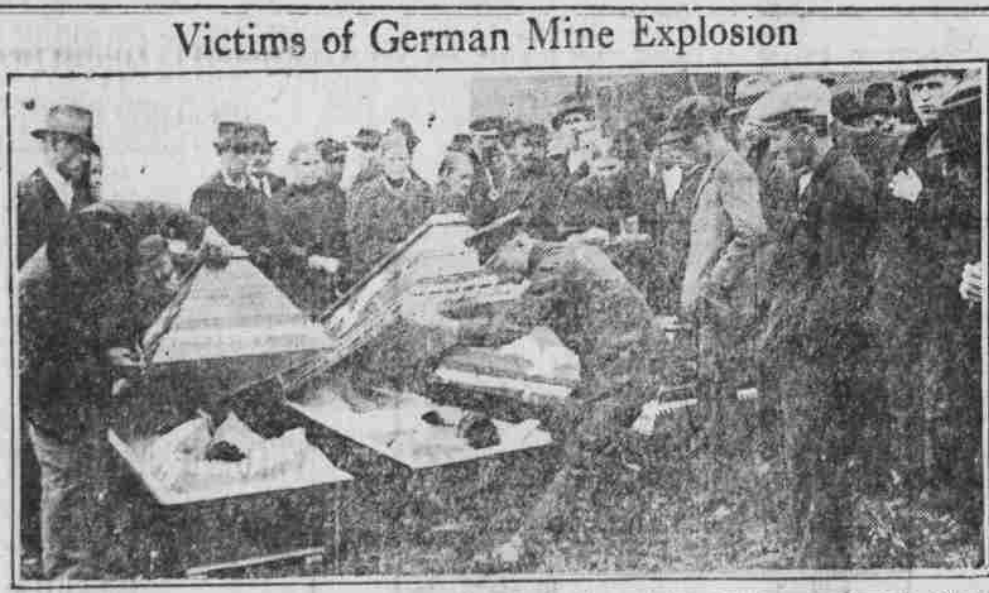
Hundreds sought to identify victims of the Mont Cenis mine explosion at Esurmund, Germany.