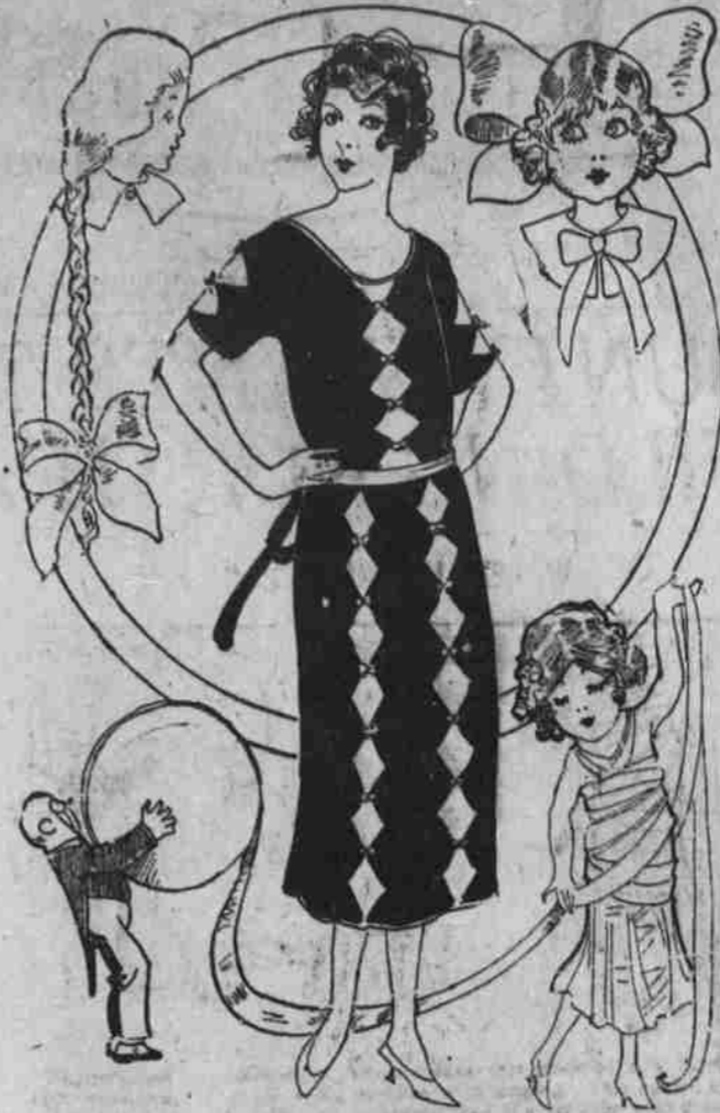
Artistic use of pekee-edged ribbon makes this frock of new satined crepe one that youth will gaze upon with longing. This model, by Braner Brothers, New York, has the appearance of a straight-lined dress but it is really shirred on at the waist with a narrow ribbon belt tying in the back. Ribbons are popular now and the new fall and winter models are very much beribboned.