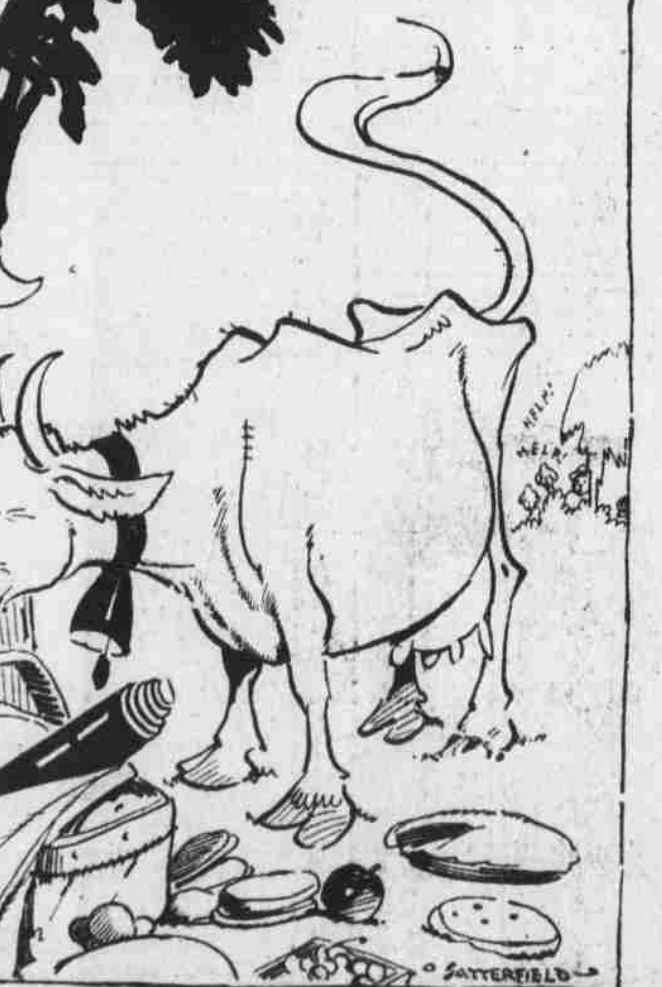
THE DANCEHOLE CROWD HAS BEEN PRACTICALLY CLEANED UP BY THE CITY BUYERS