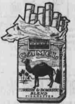
R. J. REYNOLDS Tobacco Co. Winston-Salem, N. C.

Give Camels a tryout. Buy a pack today. Get your information first hand. You'll tie to Camels, too.