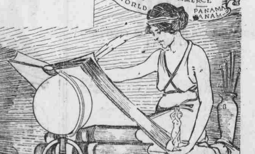
LITERATURE & ART