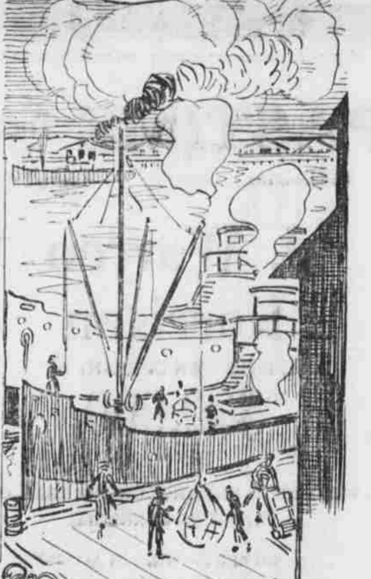
MARITIME COMMERCE OF THE WORLD PANAMA CANAL