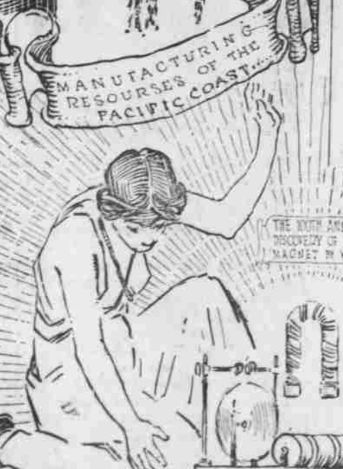
THE 100th ANNIVERSARY OF THE DISCOVERY OF THE ELECTRO-MAGNET BY WM. STURGEON