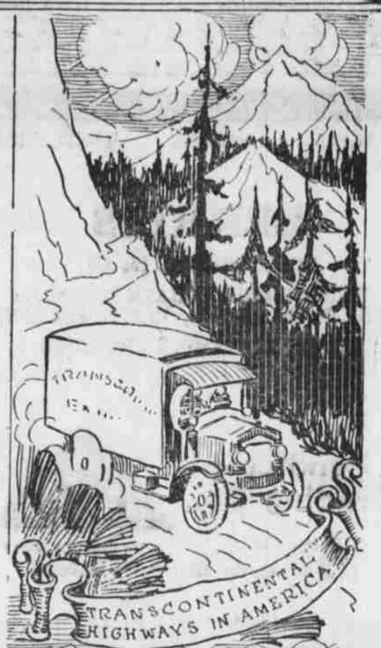
TRANSCONTINENTAL HIGHWAYS IN AMERICA