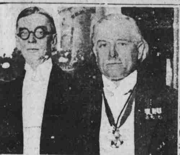
This picture shows Colonel George Harvey, U. S. ambassador to England, at his first public appearance in London. Beside him is Premier David Lloyd George. The event was the Pilgrim Dinner at which Harvey expressed the attitude of the Harding administration on foreign affairs.