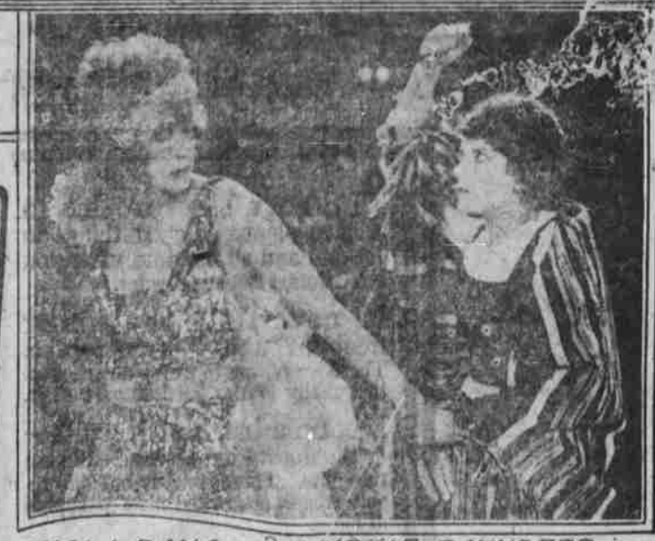
VIOLA DANA and JACKIE SAUNDERS in "PUPPETS OF FATE"