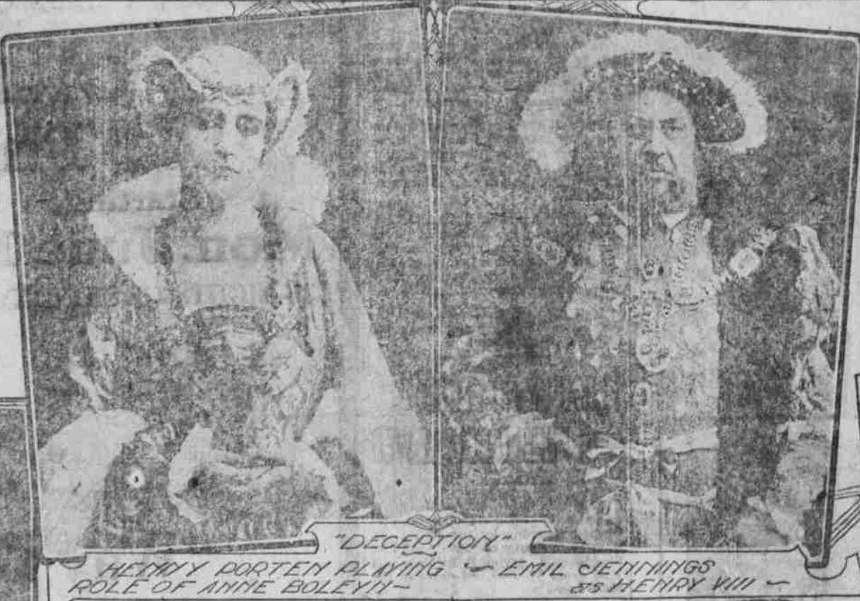
"DECEPTION" HENRY PORTEN PLAYING ROLE OF ANNE BOLEYN - EMIL JENNINGS AS HENRY VIII