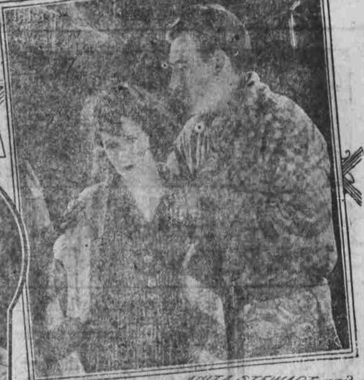
ANITA STEWART and WALTER MC GRAIL in "PLAYTHINGS OF DESTINY"