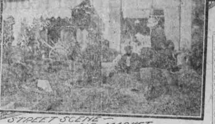
STREET SCENE - OPEN AIR MARKET