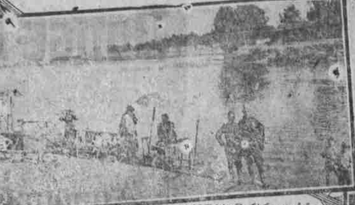
WASH DAY on the BANK of the LOIRE