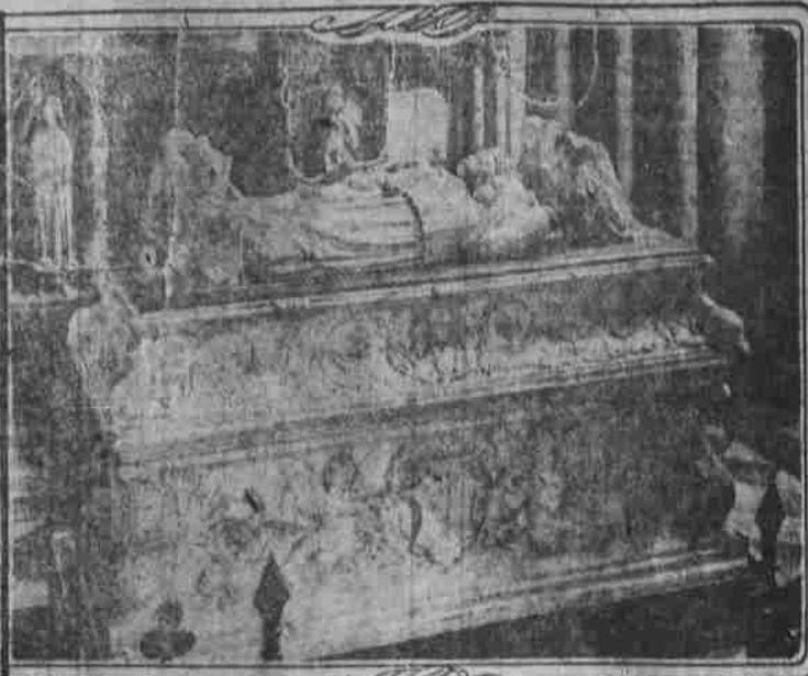
THE BEAUTIFUL TOMB of the LITTLE CHILDREN of KING CHARLES VIII