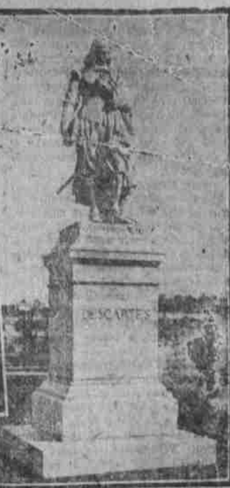
MONUMENT to DESCARTES of TOURS