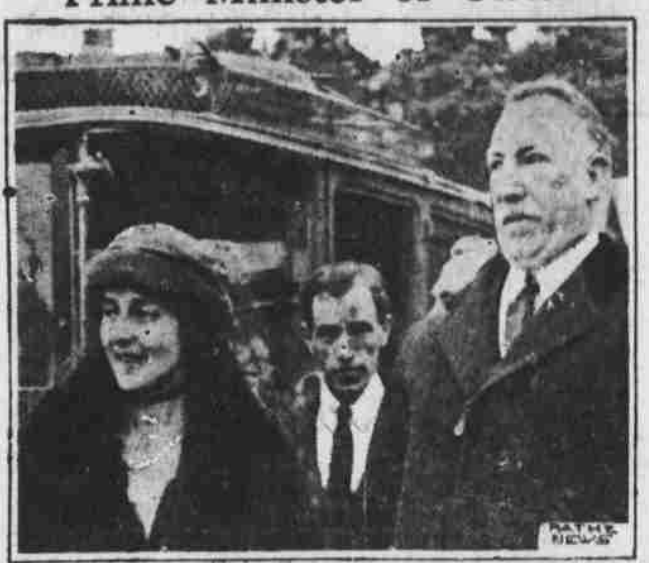
This picture shows Sir James Craig and his wife, campaigning in Belfast against Eamonn De Valera for election as prime minister of Ulster. Craig was elected. He polled 10,000 votes against De Valera's 16,000.

"Goes Insane and Kills His Wife" "Slayer Goes to Pen For Life."