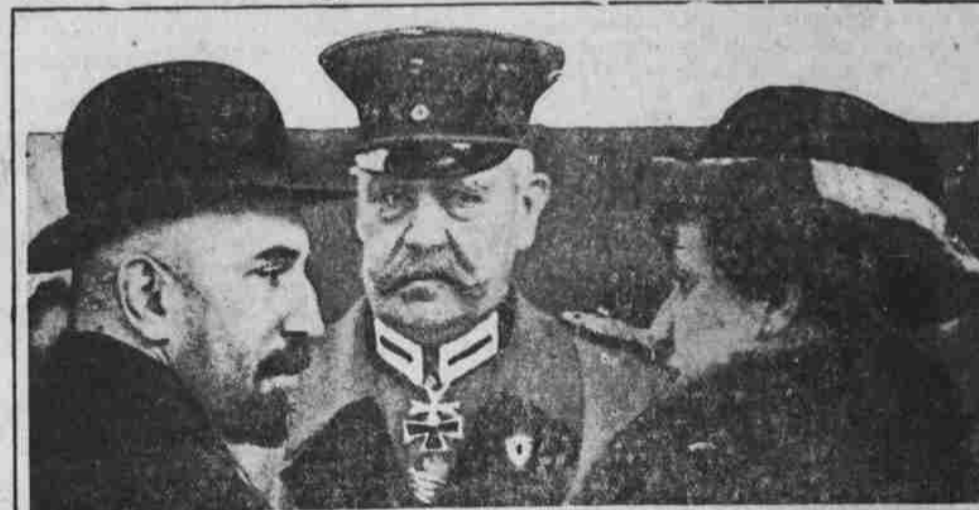
This picture, just received from Germany, shows von Hindenburg (center), former field marshal of the German army, in conference with Germany's king of industry, Hugo Stinnes, and Mrs. Stinnes. The former army commander still has hopes for the old regime—and won't discard his glittering uniform.