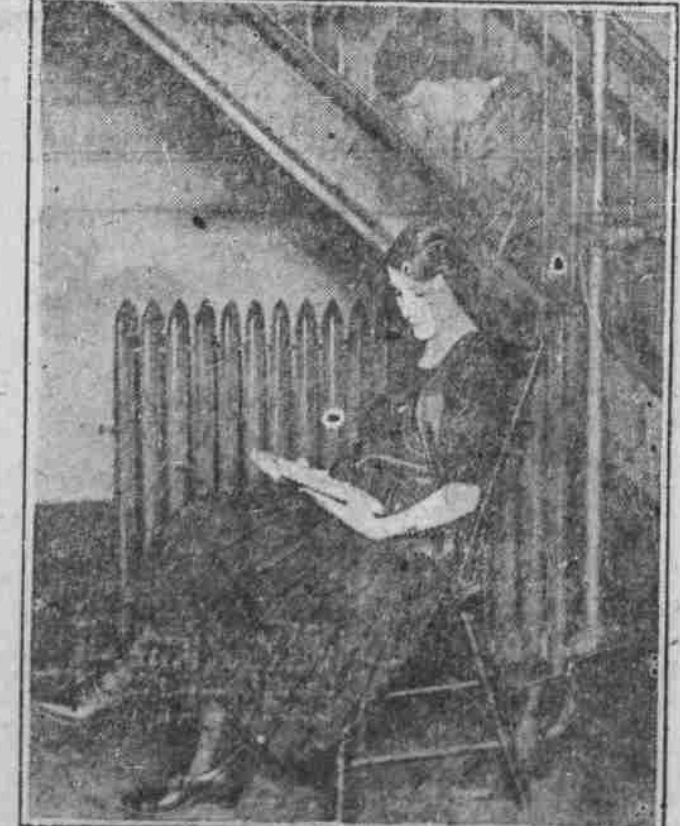
ographera. It's making a spirit photo graph. Set up the camera for a time exposure indoors. Set the aperture to just a tiny hole and expose for half the necessary time. The "spirit" moves out of the picture and the exposure is completed. That