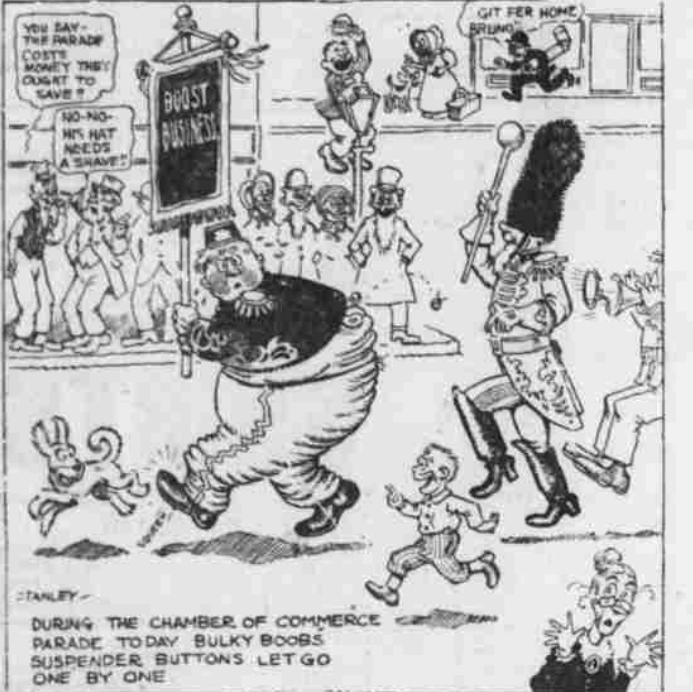
DURING THE CHAMBER OF COMMERCE PARADE TODAY BULKY BOOBS SUSPENDER, BUTTONS LET GO ONE BY ONE