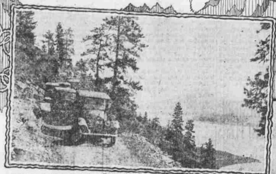
Coming Down Lizard Hill at Devil's Den, near Sandpoint, Idaho