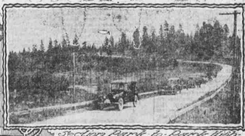
Section Park-to-Park Highway between Spokane and Newport, Wash.