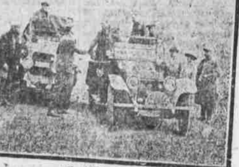
Trail Blazers at Entrance to Sequoia National Park