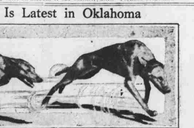
Dog racing is the thing in Tulsa, Okla. Fans turn out as strong as they do for horse racing, and the sport has grown mighty popular. There is one thing in the pasture's favor: the race can't be fixed. Try stopping a racing greyhound when it's on the fly!