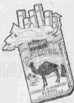
R. J. REYNOLDS Tobacco Co. Winston-Salem, N. C.

Let your own taste be the judge. Try Camels for yourself. A few smooth, refreshing puffs and you'd walk a mile for a Camel, too.