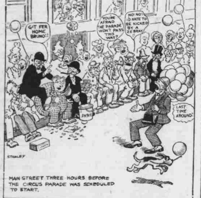
MAN STREET THREE HOURS BEFORE THE CIRCUS PARADE WAS SCHEDULED TO START.