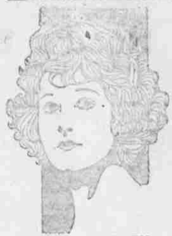
BRAY PICTOGRAPH PATHE NEWS