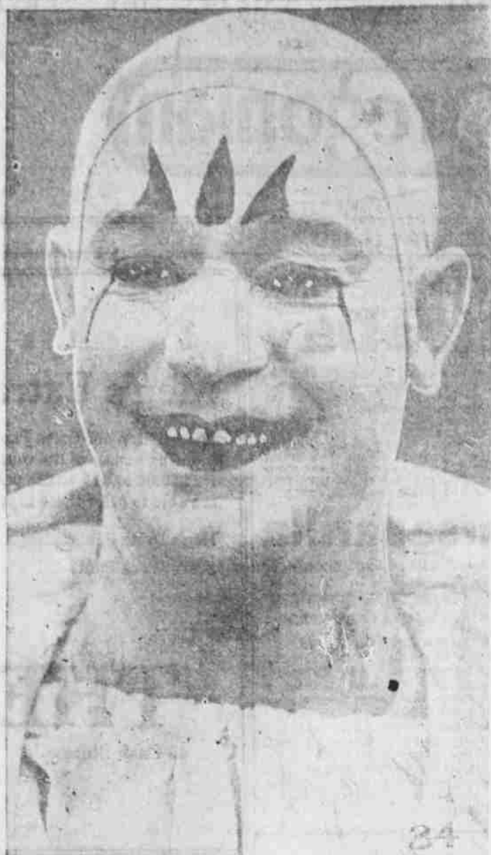
One of the many, funny clown to be here, with the Stone-Van Ambler Shows, Monday, May 14th.

ARCAD E TODAY REAL STARS AID BETTY COMPSON The cast that appears in support of Betty Compson in her first starring production, "Prisoners of Love," which opens at the Arcade today is made up of real stars in their own right. Ray Stewart was starred by Triangle and has just finished a long-term contract with Federal Productions. He has been leading man for Lillian Gish, Katherine McDonald and