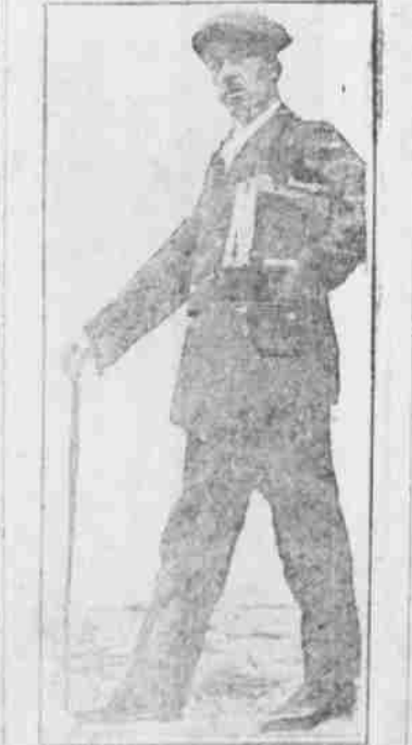
The Lucky California, who made a fortune as a bookmaker, is a bricklayer by name. He won $60,000 at the rate of $100,000 in the Italian lottery.