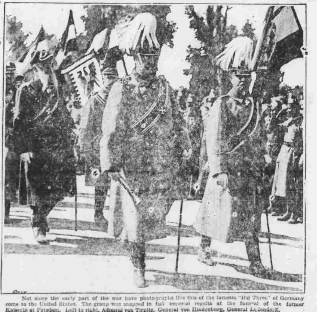
Not since the early part of the war have photographs like this of the famous "Big Three" of Germany come to the United States. The group was snapped in full imperial regalia at the funeral of the former Kaiser at Potsdam. Left to right, Admiral von Tirpitz, General von Hindenburg, General Ludendorff.