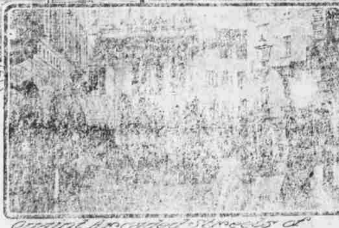
Quaint Picturesque Streets of the Old City

LOUDS were gathering and the forest-clad mountains looked sombre and still, like soldiers on strenuous duty. A storm was brewing north of the huge barrier which nature has set up in the heart of Switzerland, the mighty St. Gotthard, and storms in that part of the country are both magnificent and awe-inspiring in their superb revelation of the wrath of the elements. But we were not going to witness this spectacle today, for our goal was the Sunny South, and our eyes feasted on the glorious scenery traversed by the Gotthard line and its altogether marvelous construction. Soon the sides of steep alpine railways will be entirely operated by electricity, the mode of traction which in years to come will no doubt become general in this country, which is so richly blessed with water power.