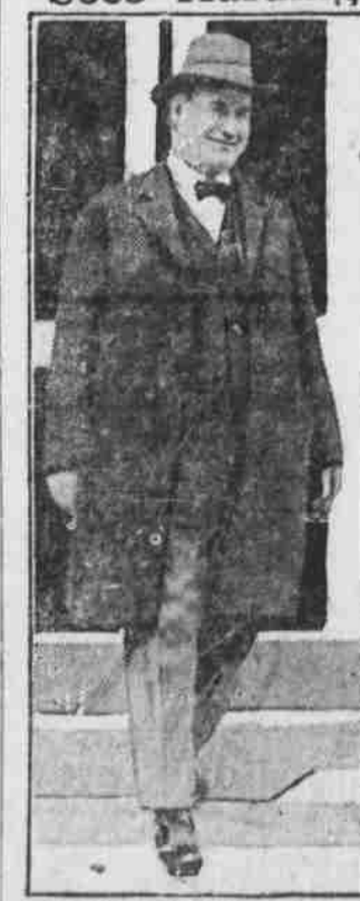
This picture of William Jennings Bryan was snapped as he was leaving the White House after calling to pay his respects to President