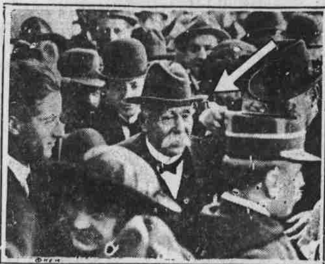
Ex-Premier Clemenceau, "The Tiger" of France, received a joyous welcome home when he returned to Paris from a six months' hunting trip in India. He is indicated by arrow.

Pa was reading about a fellow with a million dollars and no appetite. That's because he never tried