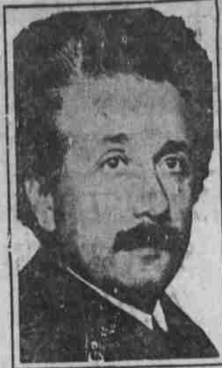
Prof. Albert Einstein, famous German physicist, is en route to the United States to discuss his "theory of relativity," proclaimed the greatest advance in science in generations.