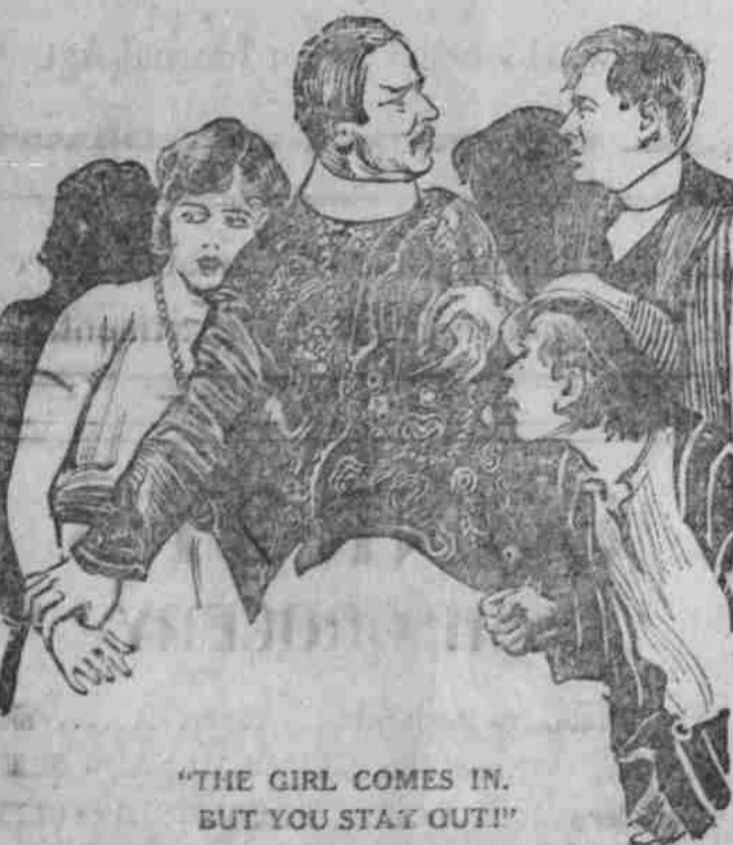
"THE GIRL COMES IN. BUT YOU STAY OUT!"

The door slammed suddenly and the girl was spotted away to the house doors where white women never return.