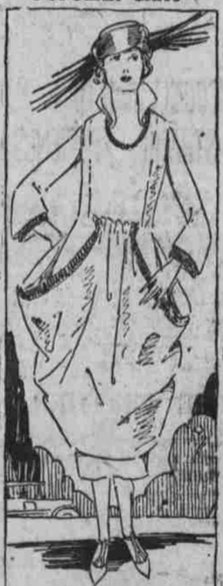
Soft taffeta in the pearl gray that leads all other colors in popularity this spring, would be effective for this new afternoon model. A contrasting note of blue effects could be used for trimming, as shown. The foundation skirt, which has little or no fullness, is joined to the straight-lined waist slightly below the normal belt line. The bouffant note is given by a draped overskirt which joins the dress by means of shirring at front and back, leaving the sides free to form full puffs.