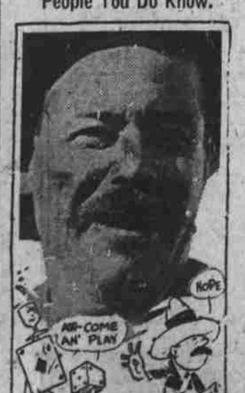
and he smokes very rarely.

Things You Don't Know About People You Do Know.