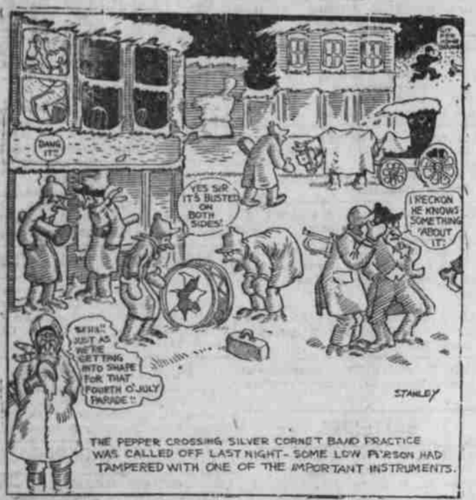
THE PEPPER CROSSING SILVER CORNET BAND PRACTICE WAS CALLED OFF LAST NIGHT—SOME LOW FELLOW HAD TAMPED WITH ONE OF THE IMPORTANT INSTRUMENTS.