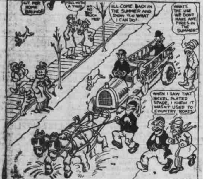
MEL PERKINS SAYS THE HILL CLIMB WAS A BIG SUCCESS. THEY ONLY WENT HALF WAY UP THE HILL IF THEY'D GONE ALL THE WAY UP - HE COULDN'T HAVE TOWED EM DOWN AGAIN TILL SPRING.