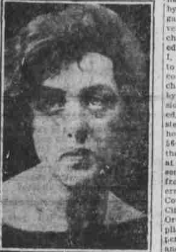
MRS. CLARE SHERIDAN

Mrs. Clare Sheridan, English sculptor, is coming to America to tell about her experience in Russia while she was making busts of Lenin, Trotsky and other chiefs of the soviet government.