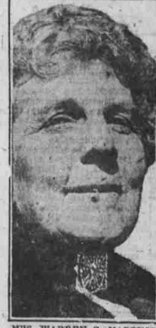
MRS. WARREN G. HARDING The diamond brooch Mrs. Warren G. Harding is wearing here is her Christmas present from the president-elect.