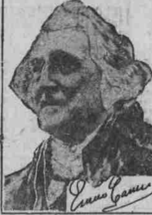
Caruso, the tenor, is also a clever cartoonist. He thinks Harding looks like George Washington. Do you? Caruso put new hair and ruffles on this photo of Harding and presto—a likeness of Washington!