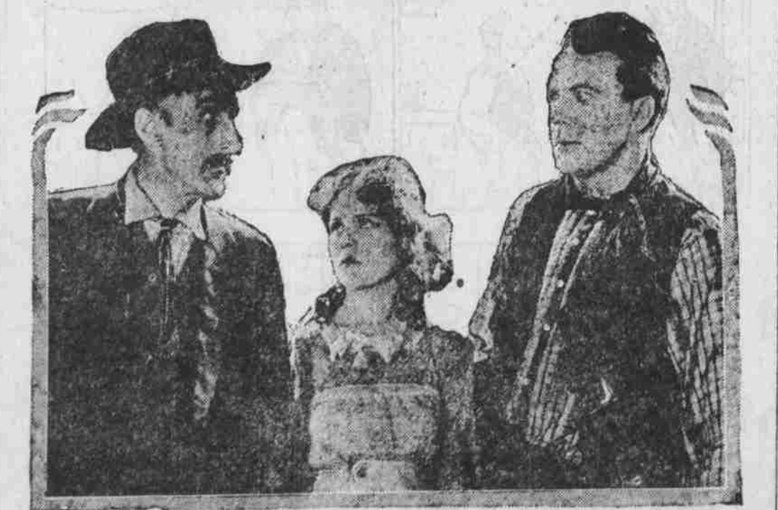
"THE GREAT REDEEMER"