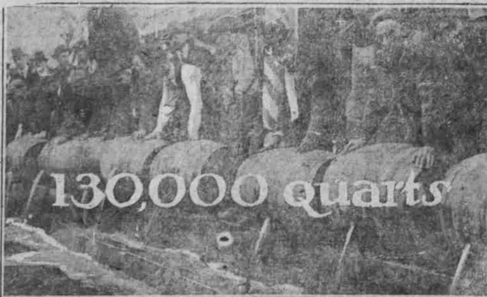
This will either make you mad or glad—it all depends. Prohibition agents accumulated 130,000 quarts of honest-to-goodness hard liquor in several months' raids in Waukegan, Ill. And here they are pouring it all down the sewer.