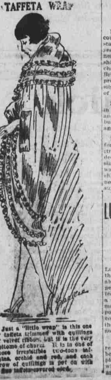
Just a "little wrap" in this one of taffeta trimmed with quilting of velvet ribbon. But it is the very epitome of charm. It is in one of those irresistible two-toned taffetas, ochre and red, and each row of quilting is set on with a blue taffeta-covered cord.

WASHINGTON, Jan. 10.—(U. P.)—Lumber manufacturers of the country, through ten regional associations are able to control production, stifle competition and prevent price declines, the federal trade commission charged in a special report. The report, with a mass of self-denigrating correspondence to support the charges, was forwarded to congress. The evidence is also given the department of justice, it was announced. Particular interest is attached to the report because the price of lumber has been a large factor in the almost complete halting of the home building, which resulted in a housing shortage and high rents.