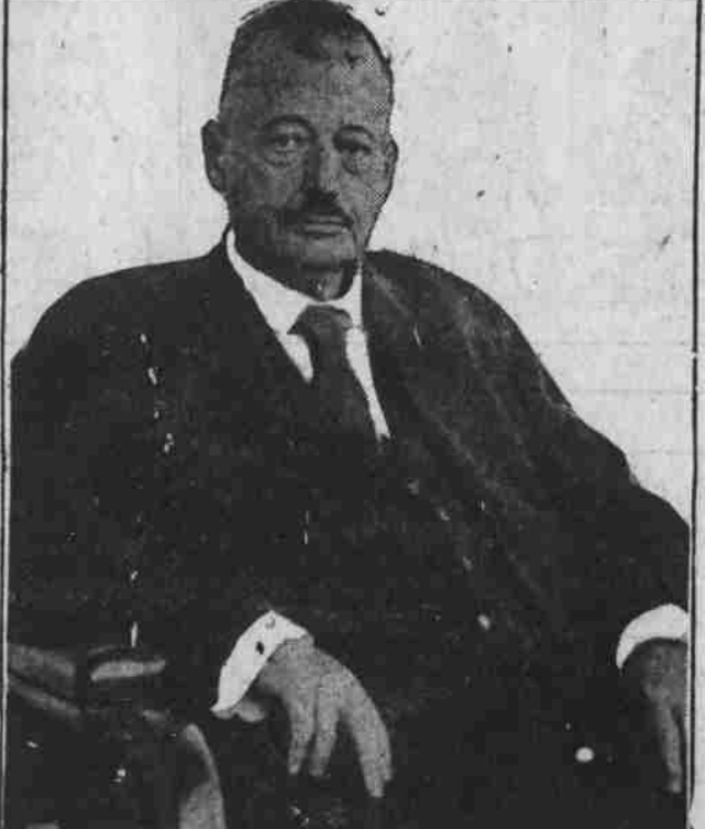
SENATOR BOIES PENROSE Senator Boies Penrose, G. O. P. leader, is back in Washington leading the fight for the tariff bill, after 13 months' absence due to serious illness. The Pennsylvania senator has lost so much weight that his clothes are baggy and he is still very weak.