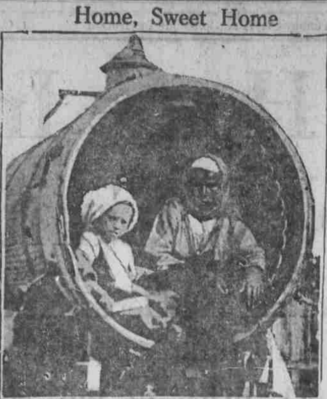
This is a delouser. It is also the home of two Greek refugees, mother and child, in the Near East Relief camp at Batum on the Black Sea. The delouser, discarded by the Russians, was the only shelter that could be found for them. Turks killed the rest of the family.