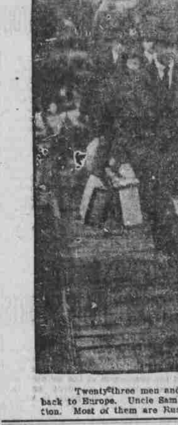
Twenty-three men and women, held by the government to be communists, are on their way back to Europe. Uncle Sam ordered them deported. They were rounded up in cities all over the nation. Most of them are Russians. They are shown starting back.